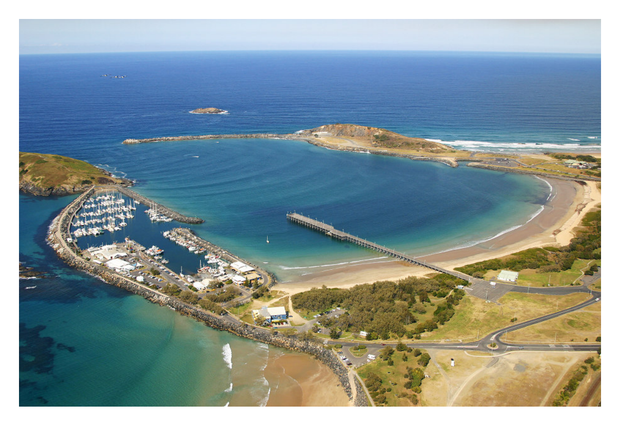
Figure 3: Coffs Harbour

While a number of dredging campaigns have occurred in the past, placement of the dredged sands in a manner and location that is acceptable in economic, social and environmental terms is becoming increasingly difficult and requires consultation and approvals from a number of stakeholders including the Marine Parks Authority and Coffs Harbour Council. Alternative strategies that are more expensive but socially and environmentally acceptable may involve the commercial sale of a portion of the dredge sand could be considered in the future to offset the cost of dredging.