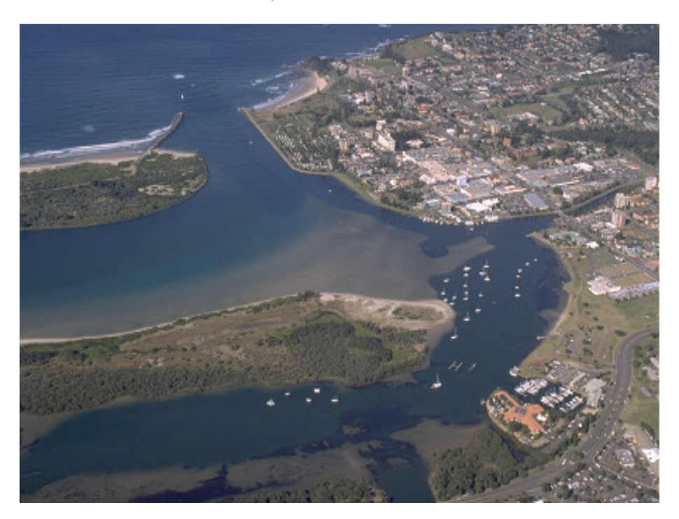
Figure 2: Hastings River entrance and lower estuary.

The Department of Lands is exploring potential partners to assist financially with the proposed dredging campaign. Possible partnerships could be with State and local Government authorities and/or the private sector where there are clear mutual benefits.