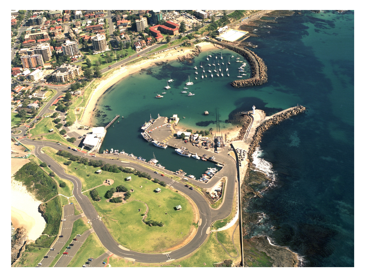
Figure 4: Wollongong Harbour

Historically, the ports on the south coast of NSW such as Wollongong, Ulladulla and Bermagui have only required dredging at infrequent intervals because of their natural characteristics which limit natural shoaling. However, should dredging be required, consideration would be given to these locations to support local and regional economies.