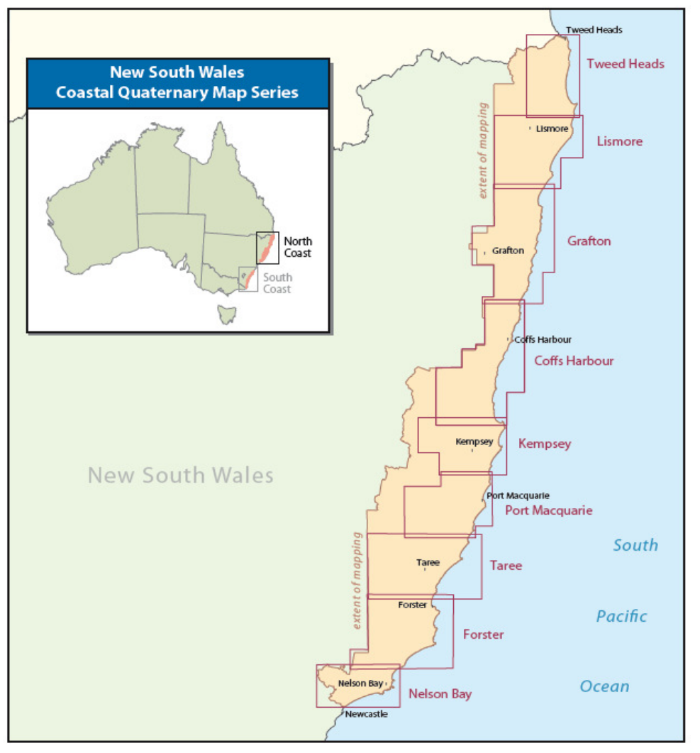
Figure 2. Index map for the recently published Coastal Quaternary Geology Map Series covering the northern CCA area.

Nine stand-alone paper geology maps are also available for the northern CCA area divided up as shown in Figure 2 (Hashimoto & Troedson, 2008). Each map sheet shows the Quatenary geology for the entire sheet at 1:100 000 scale and selected regions of interest centred on urban areas at 1:25 000. A suite of such maps depicting the southern CCA area Quaternary geology is currently in preparation.