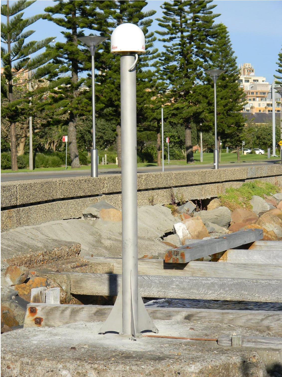
Figure 3: Newcastle East CORS pillar (including CAAM).

Following attainment of all relevant approvals, facilitation of all necessary heritage considerations and rigorous, successful pre-testing of alternative hardware setups, the Newcastle East (Pilot Station) CORS was constructed and became operational on 26 June 2012 (see Figure 3).