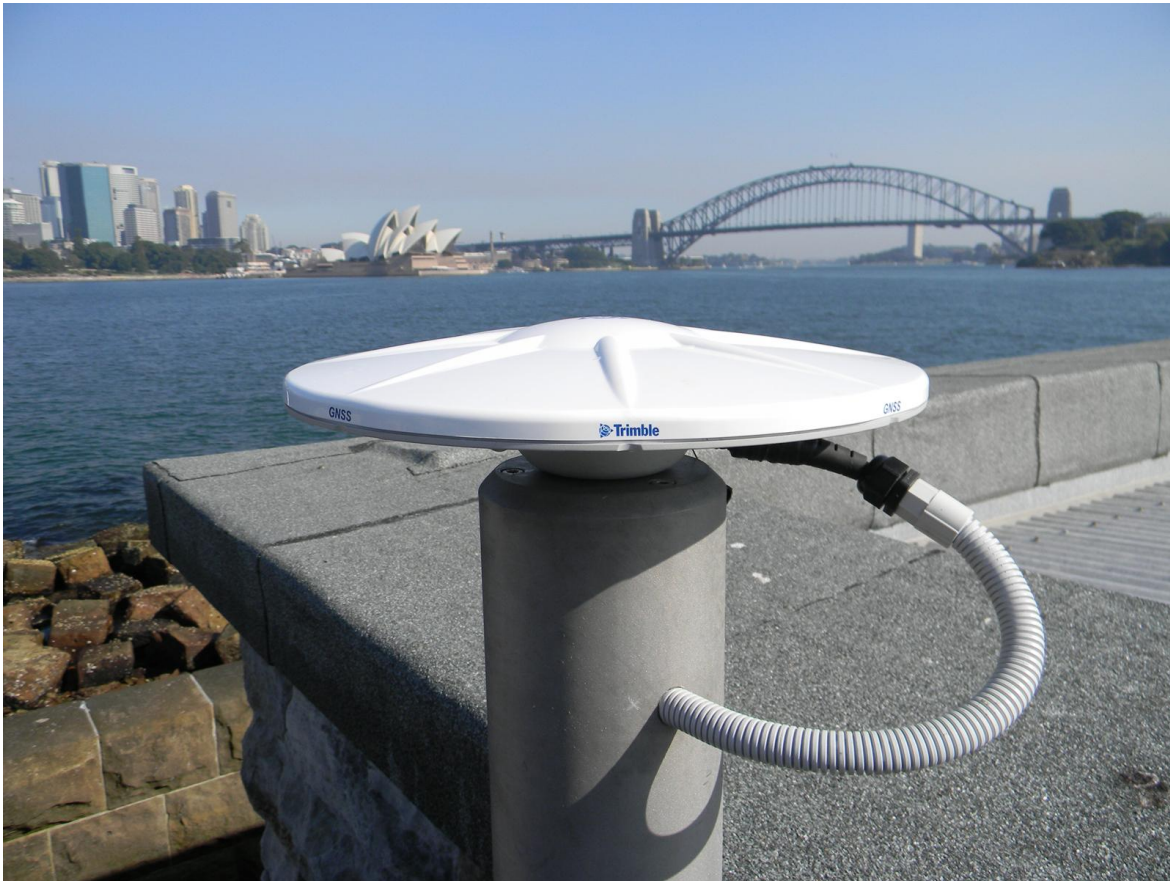
Figure 2: Fort Denison CORS antenna mount (including CAAM).

A new pier for the antenna was considered but, in consultation with a wharf construction contractor, was discounted as the required stability could not be attained given the area's tide surge characteristics and relatively shallow bedrock (i.e. a pile could not be driven into unconsolidated material, nor could a concrete foundation be made on the surface).