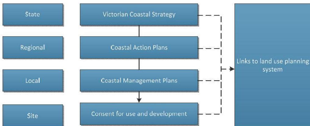
Figure 1. Coastal Planning and Management Context