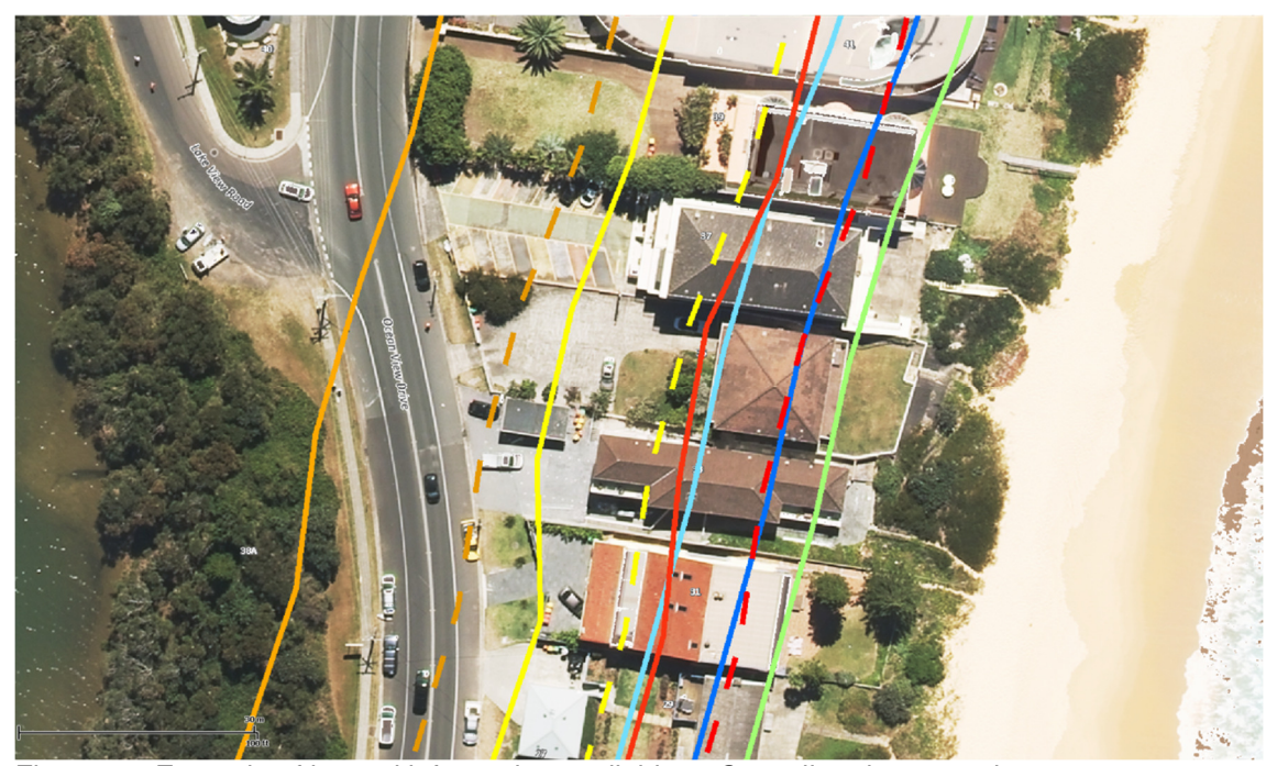
Figure 1 - Example of hazard information available to Council and community

A different planning horizon had been adopted for the open coast and Broken Bay beaches, as they are each based on the previous and location specific coastal risk assessment information undertaken separately in the 1990's. The addition of new risk information resulted in a myriad of lines and confusion in their application (see Figure 1). Of particular note was the ongoing reference to the 'immediate' hazard line which had, in some cases, been defined 20 years previously.